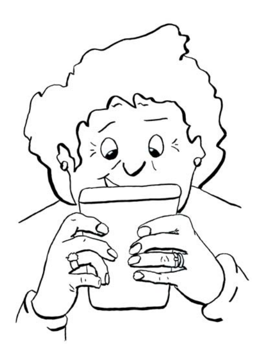
"I'm up to Level 3!" an excited Gran called out.

Plug was lost in thoughts of secret nighttime boat trips, and barrels of brandy and chests of tea being landed in the dark and smuggled up the cliffs. But they had reached the door of the cottage and Grandpa pushed it open and went in. There was a smell of cooking dinner, but it wasn't ready. A loud bleeping came from one of the armchairs that had its back to the door. They could see a small grey-haired head sticking over the top of the chair.